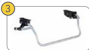
Infant Car Seat Adapter