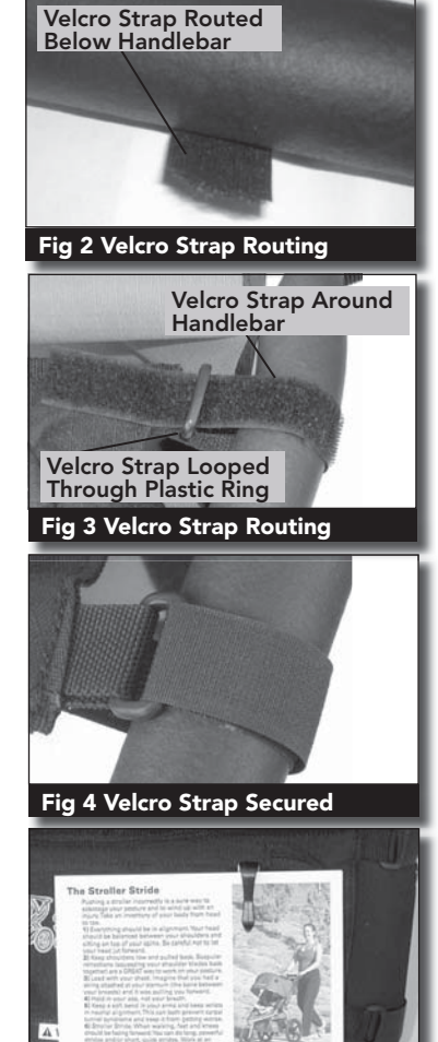
Fig 5 Exercise Manual in Clip