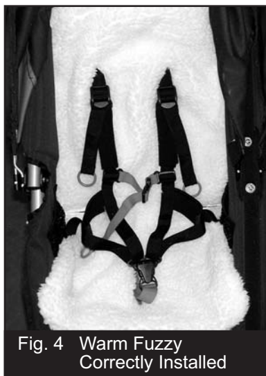
Fig. 4 Warm Fuzzy Correctly Installed