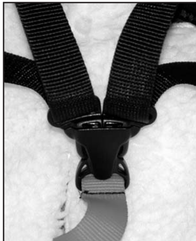
Fig. 3 Crotch Strap and Buckles Installed

in Fig. 3. Make sure the straps are not twisted. Fig. 4 shows the Warm Fuzzy correctly installed with Safety Harness components fully accessible and buckles fastened.