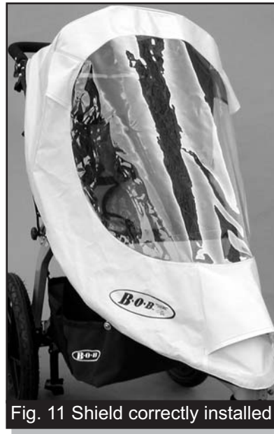
Fig. 11 Shield correctly installed

7. To place your child in the stroller, pull the front of the Weather Shield off the stroller then lift it up and over the forward edge of canopy (see Fig. 10). This will temporarily hold the Weather Shield out of your way while you