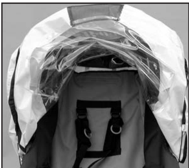
Fig. 10 Shield placed on forward edge of canopy

the black shock knobs as shown in Fig. 7. There is an opening mid way up each side with silver fabric on both ends where the elastic cord is exposed.