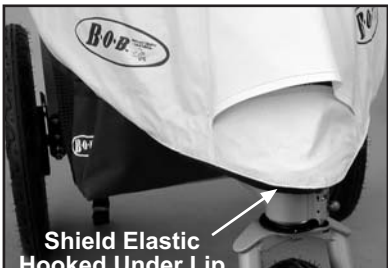
Fig. 8 Front attachment