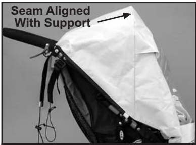
Fig. 6 Shield placed on canopy