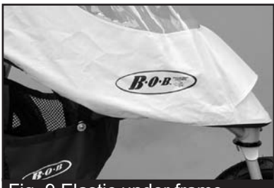
Fig. 9 Elastic under frame