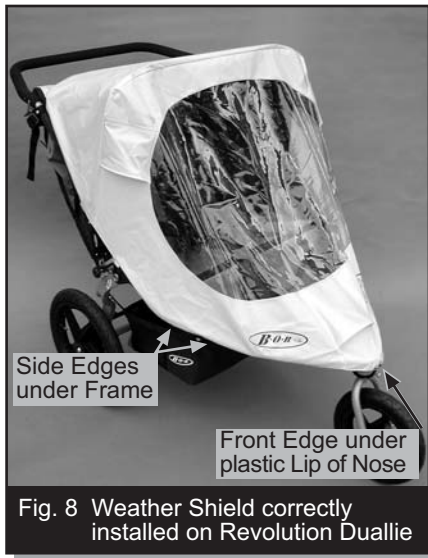
Fig. 8 Weather Shield correctly installed on Revolution Duallie

12. Once your child is secured in the safety harness (refer to your stroller Owner's Manual, Seat Safety Harness section), release the Weather Shield from canopy and re-secure under the lip on the stroller nose and under frame sides. Fig. 8 shows a Revolution Duallie Weather Shield correctly installed.