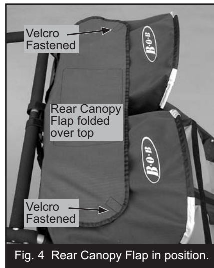
Fig. 4 Rear Canopy Flap in position.