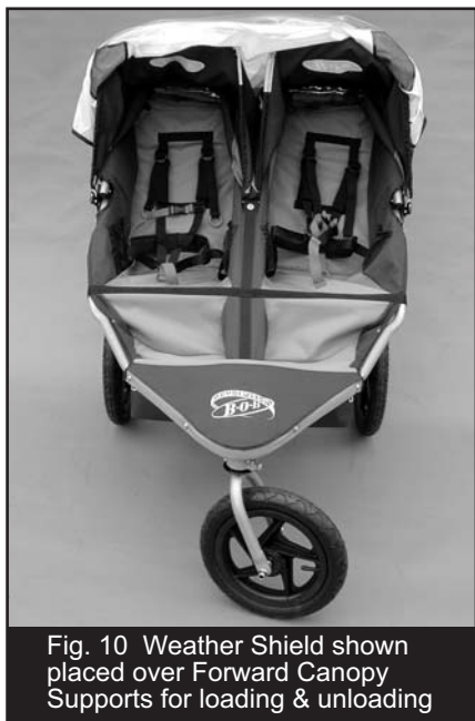
Fig. 10 Weather Shield shown placed over Forward Canopy Supports for loading & unloading