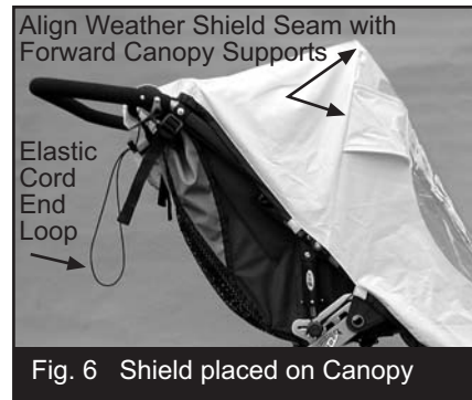
Fig. 6 Shield placed on Canopy