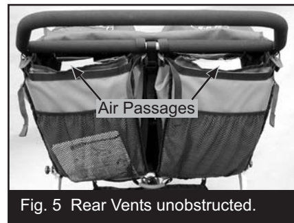
Fig. 5 Rear Vents unobstructed.