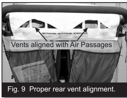
Fig. 9 Proper rear vent alignment.