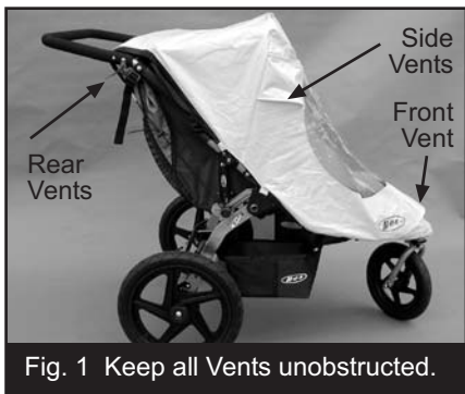
Fig. 1 Keep all Vents unobstructed.