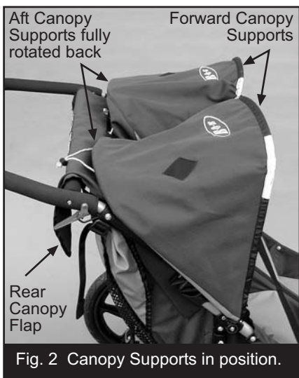
Fig. 2 Canopy Supports in position.