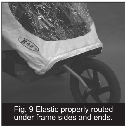
Fig. 9 Elastic properly routed under frame sides and ends.