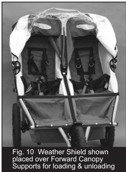
Fig. 10 Weather Shield shown placed over Forward Canopy Supports for loading & unloading