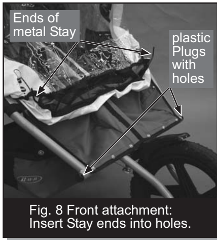
Fig. 8 Front attachment: Insert Stay ends into holes.

12. Once your child is secured in the safety harness (refer to your stroller's Owner's Manual, Seat Safety Harness section), release the Weather Shield from canopy and re-secure wire stay into holes on end plugs and elastic under frame sides. Fig. 11 shows a Weather Shield correctly installed.