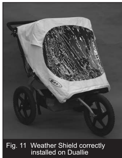
Fig. 11 Weather Shield correctly installed on Duallie